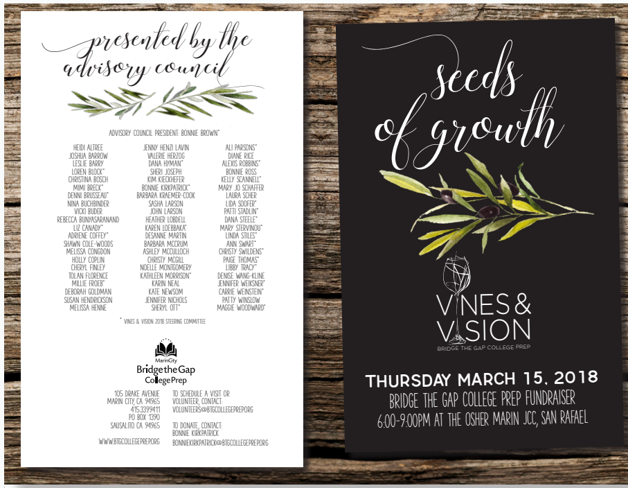
back & front of invitation print/mail